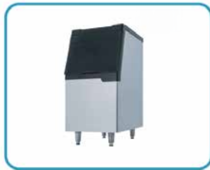
Storage Bin Option: