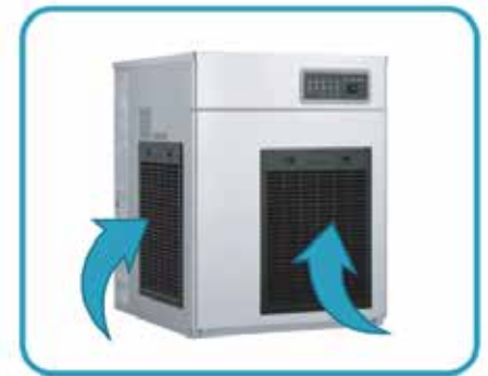
Front & Left In / Rear Out Air Flow