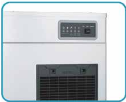
Easy to check and control by the front display